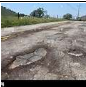
FAULTY ROAD SURFACE?