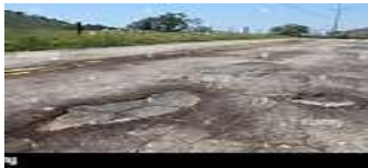
FAULTY ROAD SURFACE